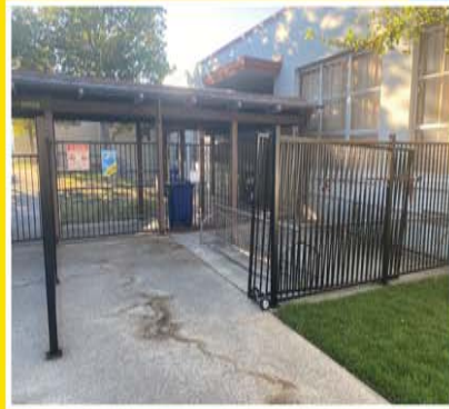
Riverview Middle School Bike Corral (Rio Vista) City of Vacaville Radar Feedback Signs